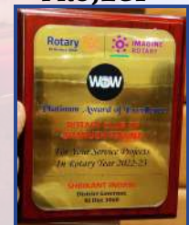
PLATINUM AWARD FOR BEST SERVICE PROJECT