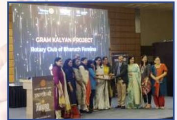
BEST GRAM KALYAN PROJECT