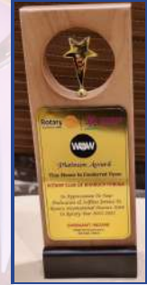
PLATINUM AWARD FOR BEST CLUB