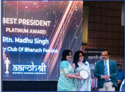
PLATINUM AWARD FOR BEST PRESIDENT

IN CONTINUATION WITH THE RICH TRADITION OF ROTARY CLUB OF BHARUCH FEMINA, THE CLUB WAS AWARDED WITH MANY LAURELS AND REWARDS FOR THE ALL ROUND WORK DONE BY THE MEMBERS GLIMPSE OF AWARDS WON