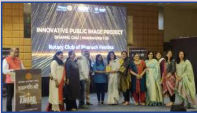
BEST INNOVATIVE PUBLIC IMAGE PROJECT - DHAMAL GALI