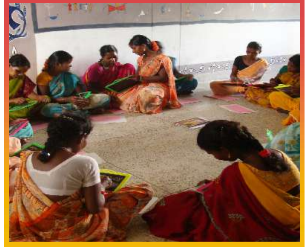
ADULT LITERACY CLASS