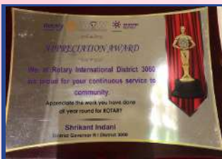
APPRECIATION AWARD FOR LITERACY