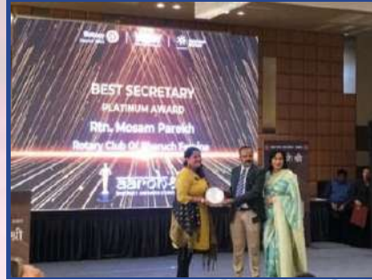
PLATINUM AWARD FOR BEST SECRETARY